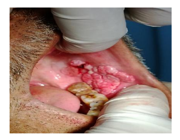
Figure 4: Post biopsy photograph.

Underlying connective tissue stroma showed infiltration of chronic inflammatory cells dilated & proliferated blood capillaries engorged with blood. Based on these features a diagnosis of Verrucous Hyperplasia was given [Figure 5].