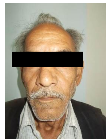
Figure 1: Extra-oral photograph of the patient

his past medical history, including his family history was unremarkable. Patient's dental history revealed extraction of multiple mobile teeth 2 years back. Patient gave a history of tobacco chewing since 20 years 2-3 times/day and also having the habit of bidi smoking 2-4 bidi/day but has quit the habit completely since last 5 years.