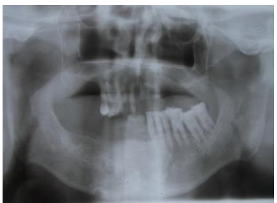
Figure 3: Photograph of Orthopantomogram

characteristic of vertucous carcinoma. These were no features of dyspalsia.