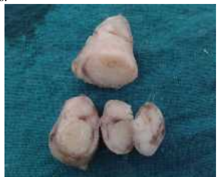
Figure 2: The cut surface showing capsule and whorled lobules.