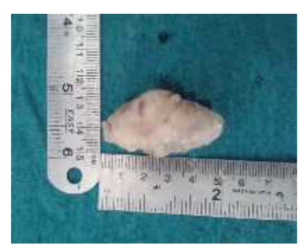
Figure 1: A fusiform shaped creamish tumor mass.

The gross specimen was oval to fusiform in shape with a smooth surface and whitish to creamish in colour, measuring about 5 X 2.5cm (Figure 1). The cut surface showed the capsule lining, with nodular or whorl-like appearance (Figure 2).